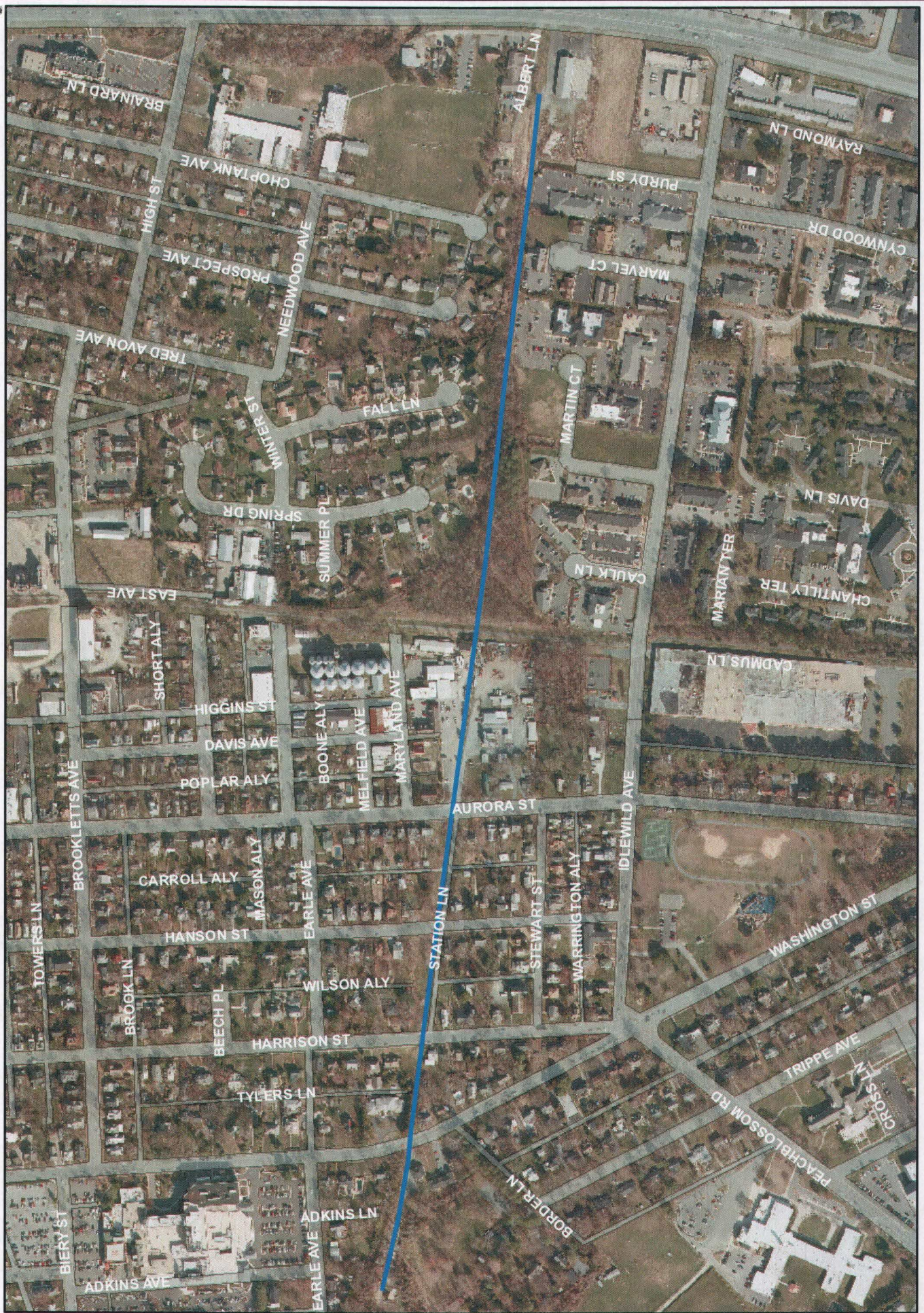
Town of Easton: Cross Town Water Connection Route